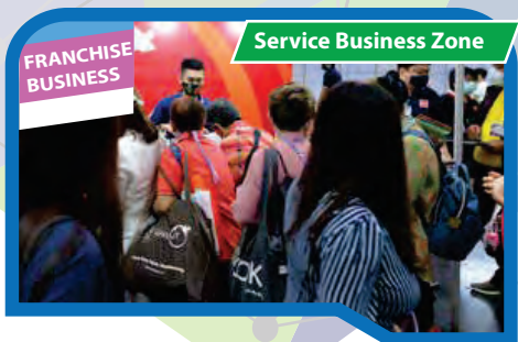
Service Business Zone