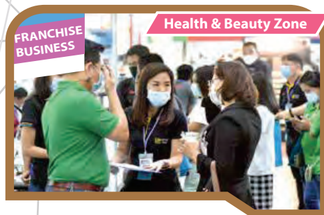
Health & Beauty Zone