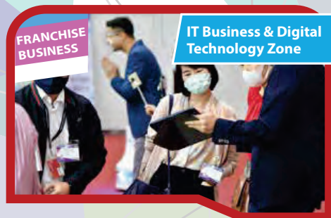
IT Business & Digital Technology Zone