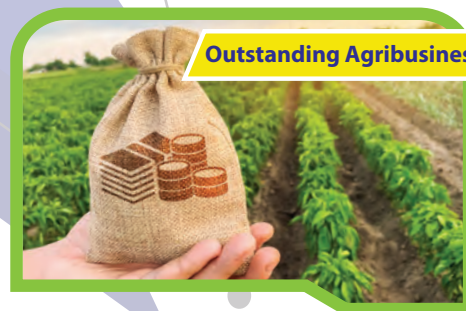
Outstanding Agribusiness Zone