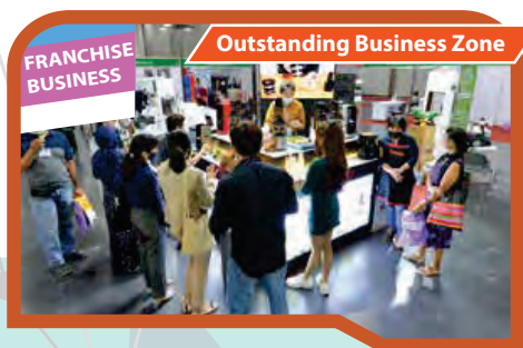
Outstanding Business Zone